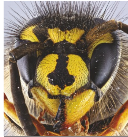
Wasps make up an enormously diverse array of insects, with some 30,000 identified species.

Pest controllers get thousands of call-outs to treat for wasps every year - so if you're having wasp issues, you're not alone! Whether you're thinking about doing some DIY wasp pest control, or you're looking to enlist the help of a professional pest management company , this guide's for you.