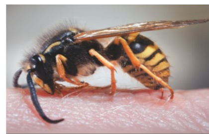
The sting of a wasp on a human hand. Note the swelling and redness.

If after a sting you have difficulties breathing, dizziness or a swollen face - you need to seek immediate medical treatment. If you've not had a severe allergic reaction, your sting will still be very painful. To treat a sting yourself: