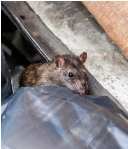
BPCA recommends local authorities do not reduce bin collections because this can attract rodents.

On the subject of household waste, reports of local authorities seeking to cut back bin collections regularly make the headlines. Rats are hard-wired to survive. They are adaptable, highly