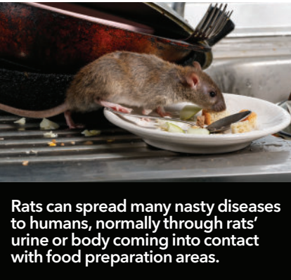
Rats can spread many nasty diseases to humans, normally through rats’ urine or body coming into contact with food preparation areas.

rats are not just limited to public health. They also have a knack for causing structural damage.