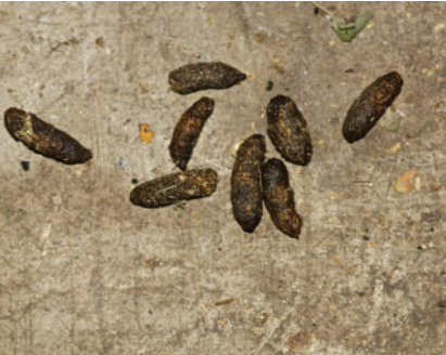
Rat droppings are dark and pellet-shaped.