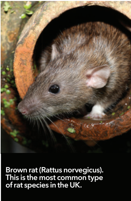
Brown rat ( Rattus norvegicus ). This is the most common type of rat species in the UK.

Whether you’re thinking about doing some DIY pest control or you’re looking to enlist the help of a professional pest management company, this guide is for you.